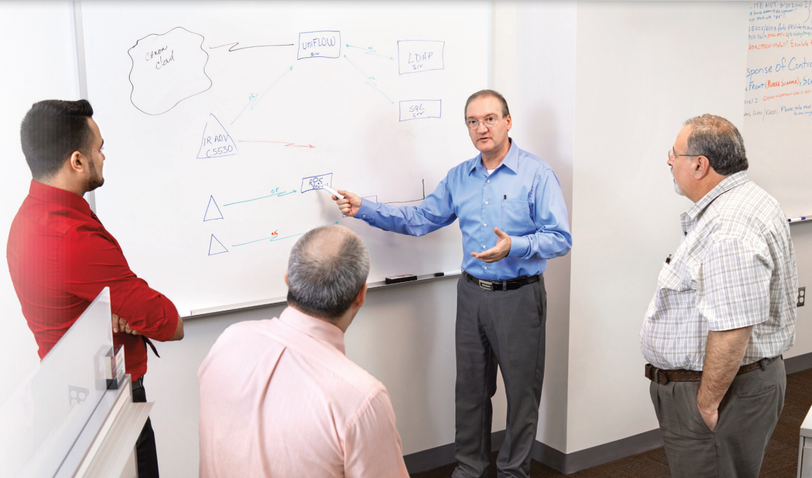
Customer Solutions Center, Melville, NY